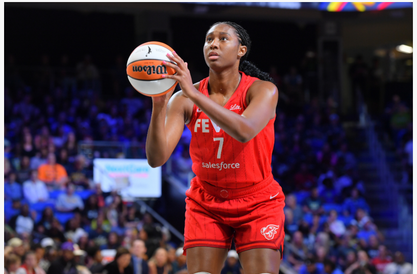
Indiana Fever center Aliyah Boston prepares to shoot a free throw during a WNBA game.

EINPresswire.com/ -- The Indy Chamber outlined why the Indianapolis region has become a concentrated hub for sports careers, women's sports leadership, sports-tech, major events, and family access to elite facilities.