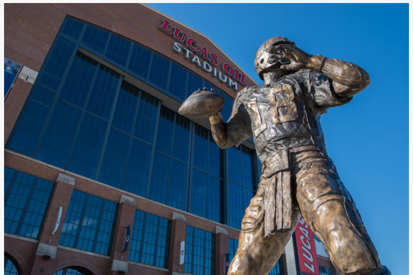
Quarterback statue in a passing pose outside Lucas Oil Stadium in downtown Indianapolis.