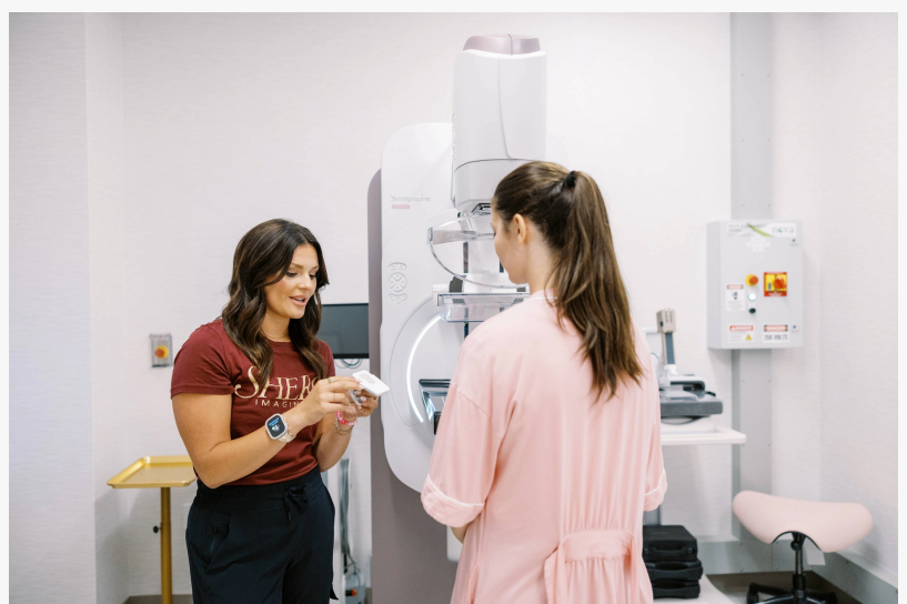
Technician instructs patient using self-compression mammography technology