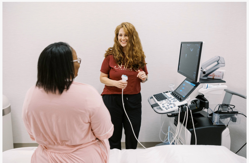
Putting the patient at ease with personalized care and expert technicians

This press release can be viewed online at: https://www.einpresswire.com/article/853637701