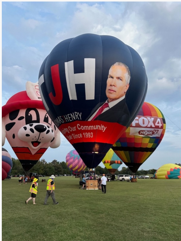
TJH Balloon at Plano Balloon Festival