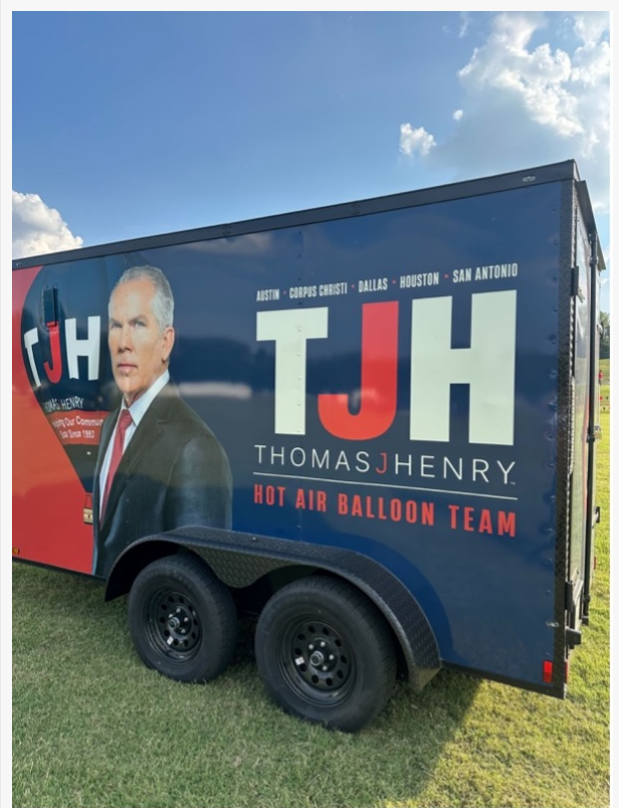
TJH Balloon Team at Plano Balloon Festival

Outside of the courtroom, the firm is known for its many philanthropic endeavors and generous contributions to local and global communities. The firm has an active philanthropy program that supports causes related to poverty, veterans, national disaster relief, education, animals, and the arts.