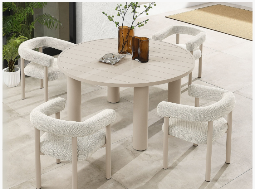
Decorate Your Living Space for Halloween