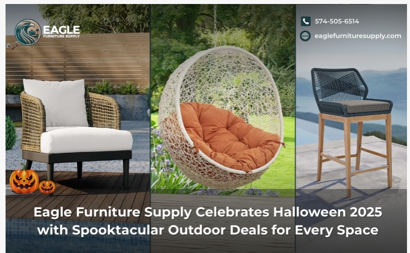
Hauntingly Beautiful Spaces Await

This holiday season, Eagle Furniture Supply is highlighting its patio and outdoor collection, boasting classic designs that are designed to complement Halloween adornments while providing comfort and functionality. Shoppers can take great advantage of discounts on outdoor side tables and coffee tables ideal for showing off colorful centerpieces, pumpkins, and candies for trick-or-treaters. These must-haves are accompanied by modern coffee and end table sets designed to facilitate warm outdoor gatherings against cool autumn skies.