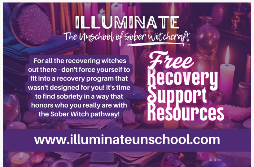
Free Recovery Support