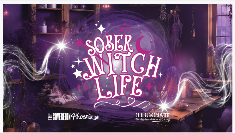
Sober Witch Life

As a co-op, Book Suey’s mission is rooted in the same values that drive the Sober Witch Life