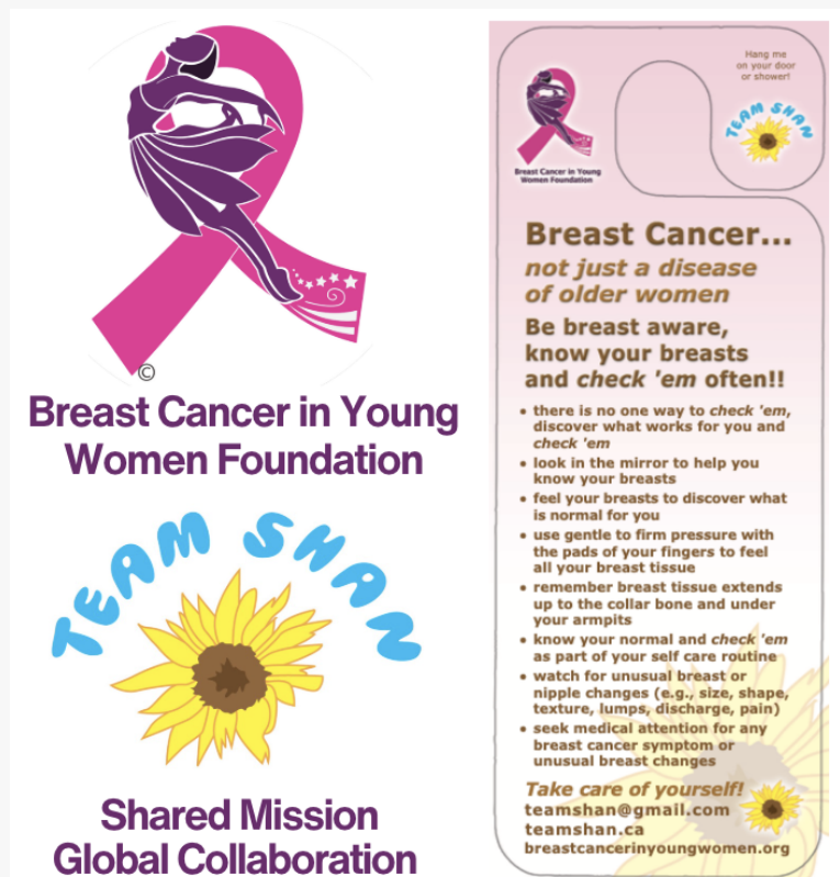
BCYWF-Team Shan Shared Outreach Message.