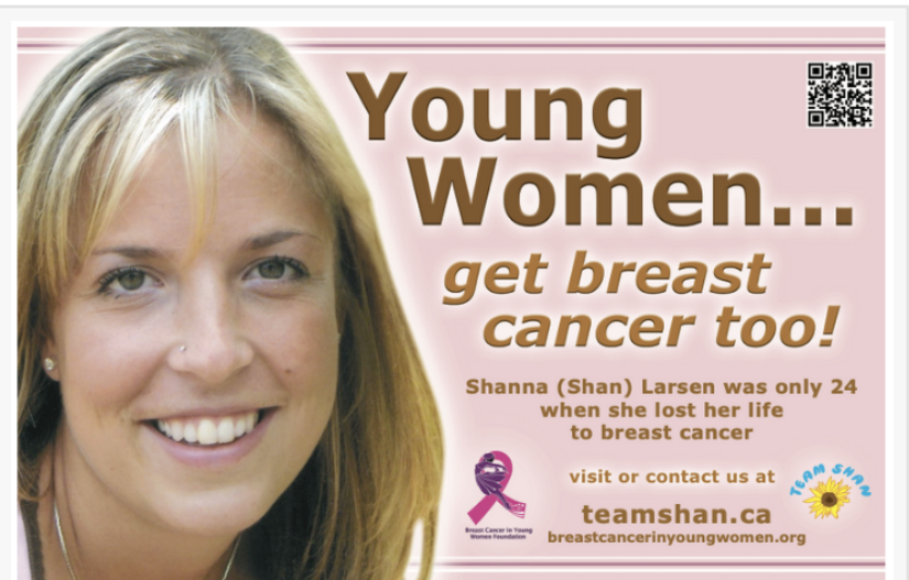
BCYWF-Team Shared Outreach Message.

Every contribution – big or small – helps the BCYW Foundation fulfil its mission to save the lives of young women from breast cancer in the years to come. Thank you for your generosity.