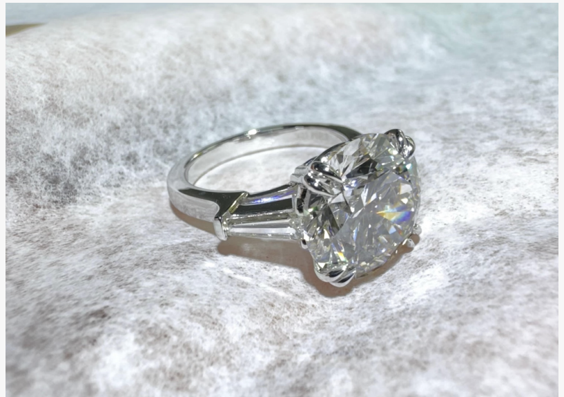
a stunning 18K White Gold Ophira Diamonds ring