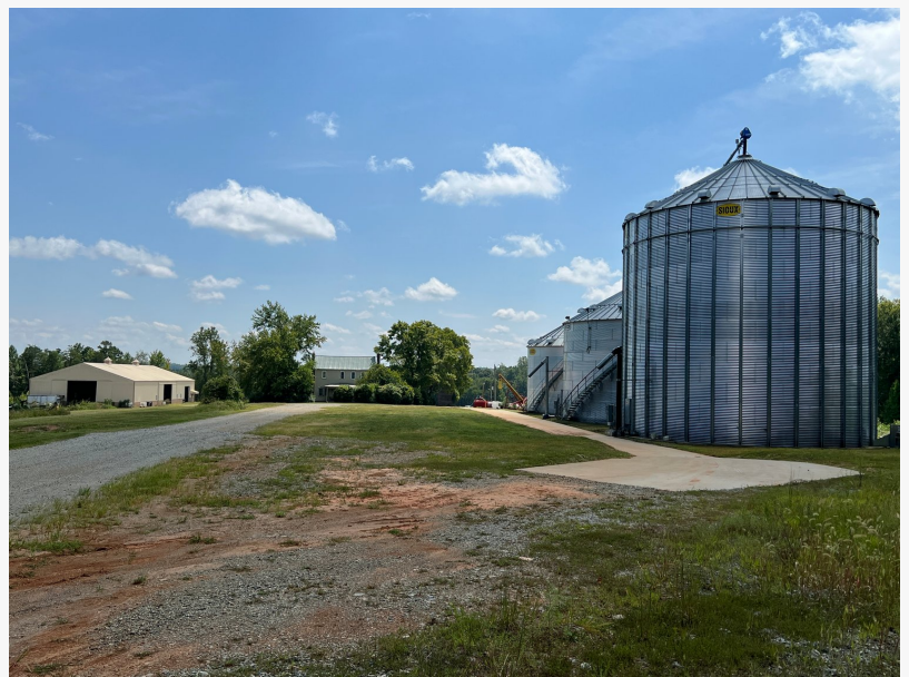
940 Ambler Rd., Louisa, VA 23093 Auction Location: Auction will be off site at the Best Western Plus Crossroads Inn & Suites, 135 Wood Ridge Terrace, Zion Crossroads, VA

Nicholls Auction Marketing Group, Inc., is a professional accelerated marketing firm specializing in the promotion and sale of real estate via the auction method of marketing. Headquartered in Fredericksburg, VA, NAMG has been serving the needs of the Mid-Atlantic region since 1968. The Nicholls team comprises world and state champion auctioneers, an award winning marketing staff, and sales percentages unmatched in the industry. For more information about Nicholls Auction Marketing Group, Inc., visit www.nichollsauction.com or call 540-898-0971.