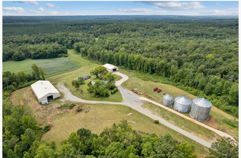
940 Ambler Rd., Louisa, VA 23093 Auction Location: Auction will be off site at the Best Western Plus Crossroads Inn & Suites, 135 Wood Ridge Terrace, Zion Crossroads, VA