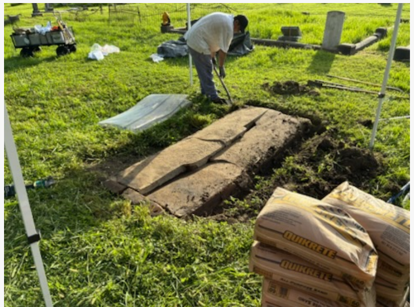
Volunteers work hard to maintain the grounds and help repair major damages while fighting overdevelopment nearby