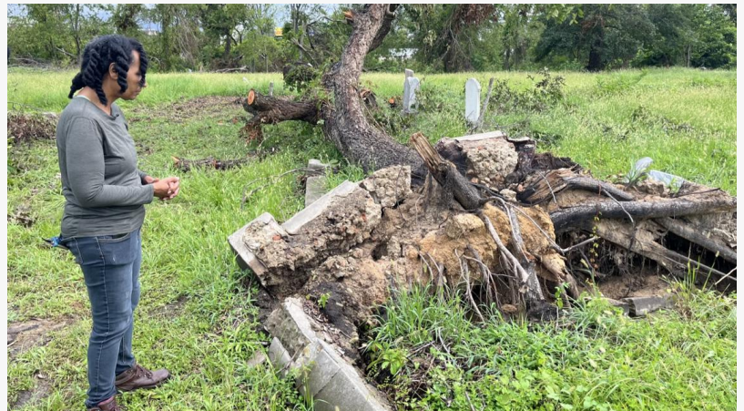
Olivewood Cemetery faces severe storm damage, erosion, and extreme repair costs.

In recent years, Olivewood has drawn local and national attention—recognized among America's 11 Most Endangered Historic Places and supported by new preservation investments. In 2025, Olivewood was awarded a $200,000 grant through the African American Cultural Heritage Action Fund to accelerate restoration and site protection. These milestones underscore the urgency and momentum