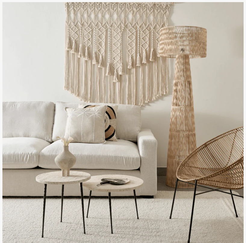
Garden seating ideas with outdoor pouf and ergonomic design

The UAE's cultural emphasis on hospitality also makes adaptable seating important. With frequent gatherings of friends, relatives, and colleagues, hosts require furniture that expands and contracts with the guest list. Outdoor poufs meet this demand by serving as additional seats that can be placed in clusters or dispersed throughout a garden. Their convenience, however, does not come at the cost of elegance—modern