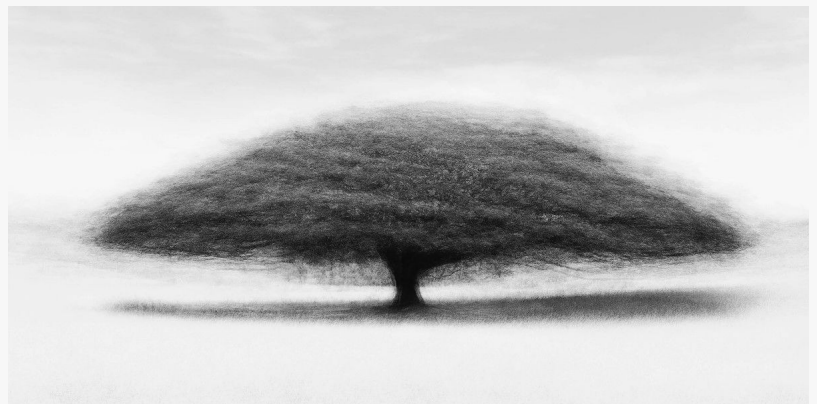
CALI B&W #8, 2019