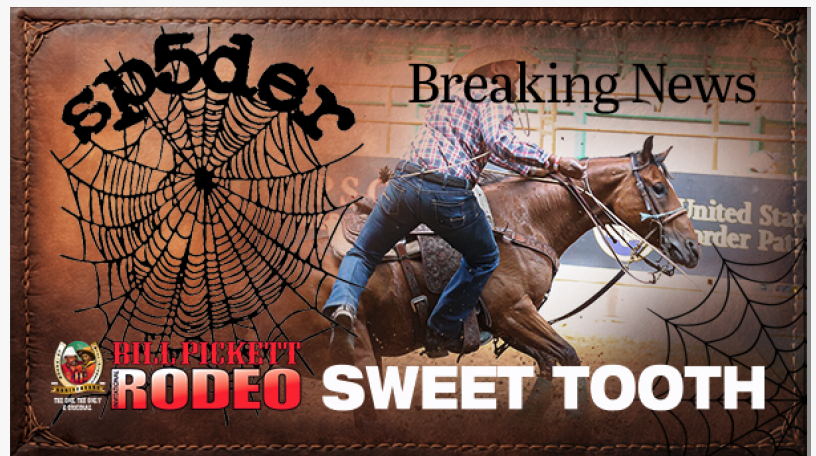
SP5DER Breaking News! BPIR Sweet Tooth Rodeo in Houston, TX

"The Bill Pickett Invitational Rodeo has spent 41 years celebrating the legacy of Black Cowboys and Cowgirls, and we are thrilled to partner with SP5DER for The Sweet Tooth Rodeo. This event is a unique opportunity to honor our