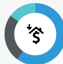
Mortgages with payment decreases

■ Fixed rate with a term of less than 5 years ■ Fixed rate with a term of 5 years or more ■ Variable rate, fixed payments ■ Variable rate, variable payments