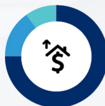
Mortgages with payment increases

■ Fixed rate with a term of less than 5 years ■ Fixed rate with a term of 5 years or more ■ Variable rate, fixed payments ■ Variable rate, variable payments