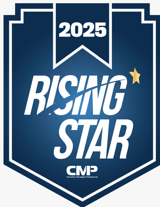
The official logo for the 2025 Rising Star award, presented by Canadian Mortgage Professional (CMP).