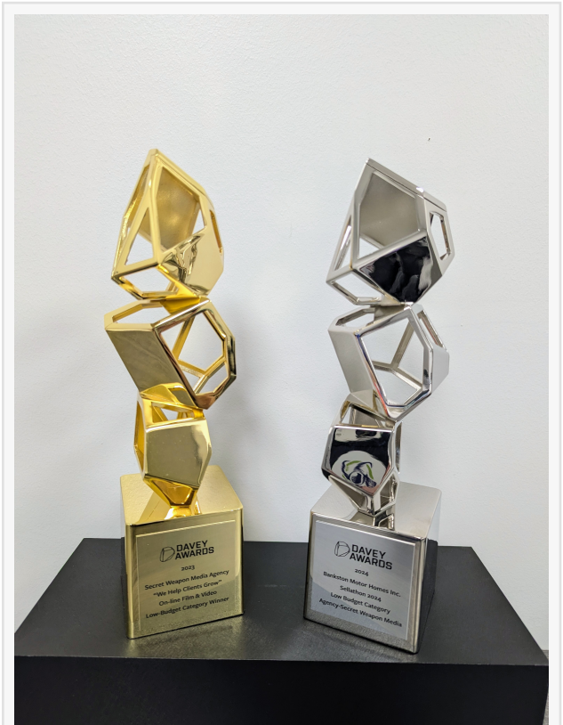
Secret Weapon Media Agency has earned multiple Davey Awards, including a Gold Davey in 2023 for creative excellence in advertising.

Headquartered in Huntsville-Madison, AL, Secret Weapon Media operates in a nationally recognized tech center, Forbes ranks Huntsville #1 in the U.S. for engineers per capita. With the U.S. Space Command headquarters relocating to Redstone Arsenal and the region adding dozens of new residents daily, local businesses are competing in a fast-growing, high-skill economy - exactly where a research-backed Tactical Battle Plan® delivers outsized value.