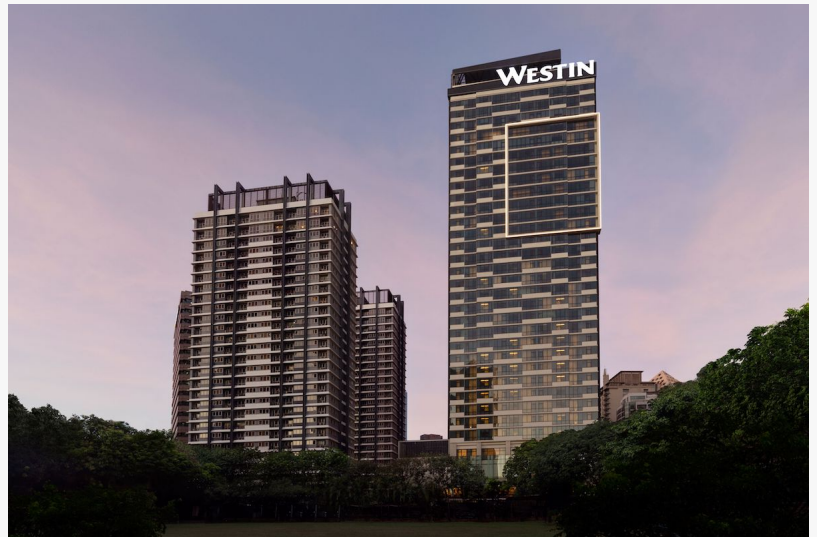
The Westin Manila

SANTA MONICA, CA, UNITED STATES, October 3, 2025 /EINPresswire.com/ -- Green Globe has recently awarded The Westin Manila its inaugural certification in acknowledgement of its sustainable management and operations. Located in the Ortigas business district, and not far from the Ninoy Quino International Airport, the Westin Manila offers a gateway to Metro Manila's corporate centers and shopping. Premium hospitality and state-of-the-art facilities focus on helping guests realize the best version of themselves where cherished pets are also welcomed at the 5-star property in the Philippines' capital.