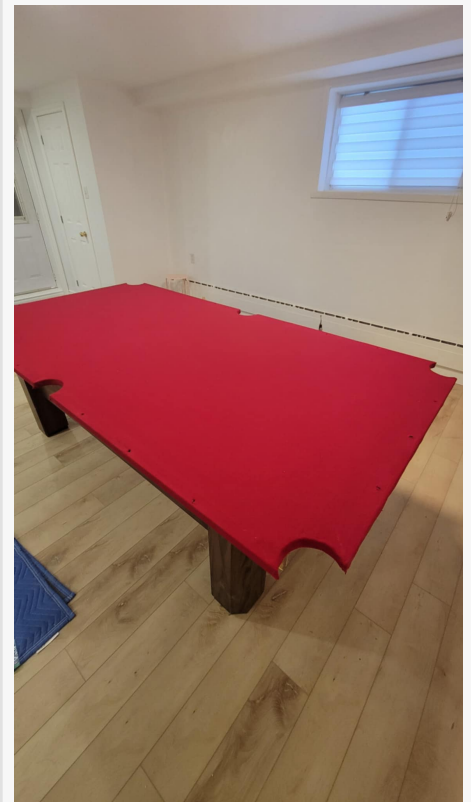
Pool table moving and assembling