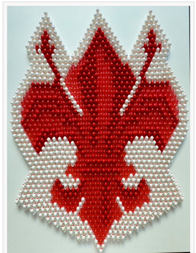
Firenze Illuminated panel from The Sublime Essence of Light and Darkness by Facundo Yebne FLY exhibited at Florence Biennale XV Fortezza da Basso Florence

This press release can be viewed online at: https://www.einpresswire.com/article/855627831