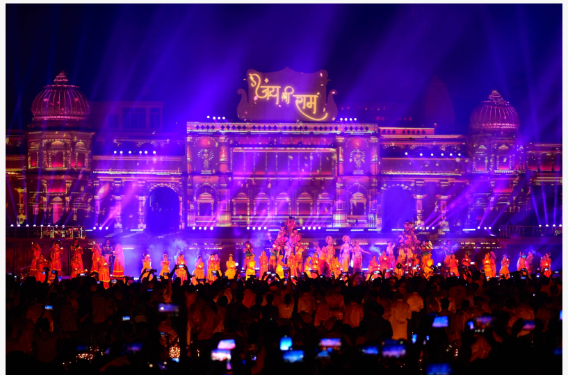
Live performers bring the Ramayana to life through thematic tableaux, choreography and animations.