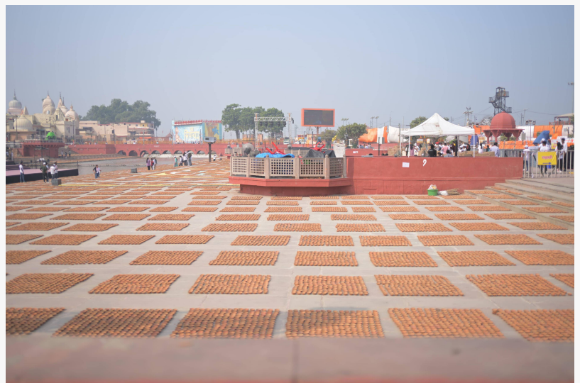
Lakhs of Diyas are lit to create an enchanting sight

Deepotsav commemorates the triumphant return of Lord Ram to Ayodhya, as depicted in the epic Ramayana. The Uttar Pradesh government has elevated this festival into a global spectacle that marries devotion with innovation. This edition will feature a 45-minute multimedia projection and laser show at Ram ki Paidi, where more than 100 live performers will bring the Ramayana to life through thematic tableaux, choreography and animations. Adding to the grandeur, tableaux from 21 states will showcase India's diverse cultural heritage, making Deepotsav a true national celebration. Stretching over 200 meters along the riverfront, the performance will integrate projection mapping, fireworks, and musical narration to create a fully immersive experience that transports audiences back to the era of Lord Ram's homecoming.