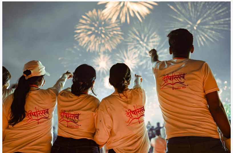
Enchanting sight of fire crackers in open sky delight the visitors