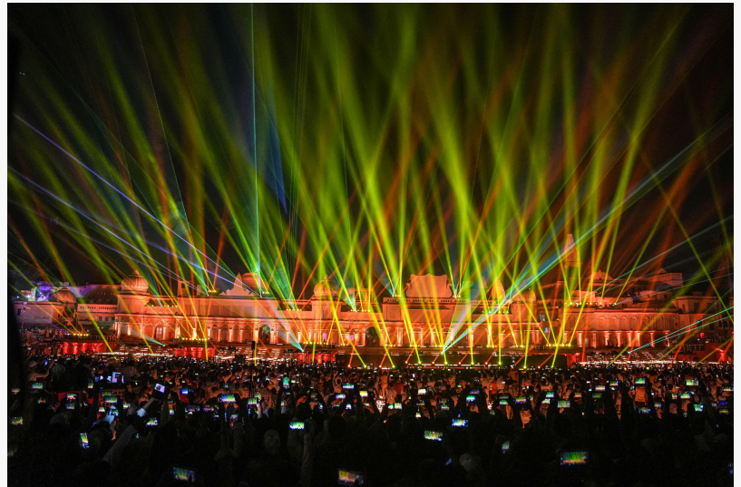
A laser show on the banks of the Saryu river during 'Deepotsav' on the eve of Diwali

Hon'ble Minister of Tourism and Culture, Government of Uttar Pradesh, Mr. Jaiveer Singh, said, "Under the guidance of Chief Minister Shri Yogi Adityanath, Uttar Pradesh is positioning itself as a leader in cultural tourism, inviting the world to witness this grand celebration. Deepotsav 2025 is not merely a festival of lights; it is India's