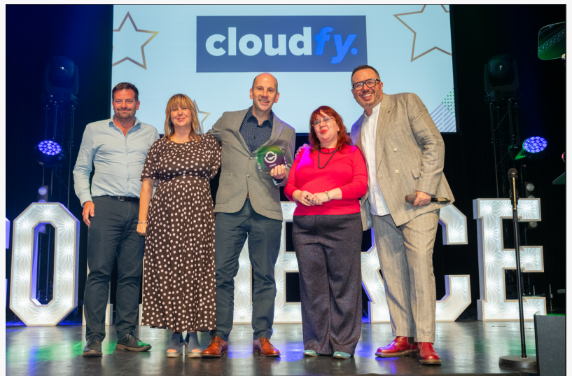
Ecommerce Awards London Photo

/EINPresswire.com/ -- Cloudfy, a leading B2B eCommerce platform, has been awarded the Best eCommerce Platform at the 2025 eCommerce Awards. This recognition highlights Cloudfy's ability to simplify complex B2B sales processes, integrate seamlessly with enterprise resource planning (ERP) systems, and enable organizations across industries from pharmaceuticals to food distribution and packaging to scale confidently in global markets.