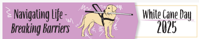
White Cane Day

This press release can be viewed online at: https://www.einpresswire.com/article/855749191