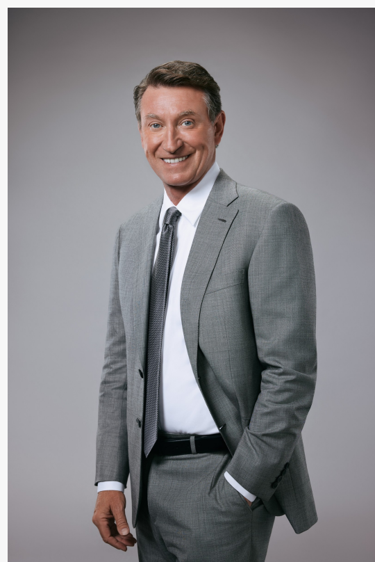
The AAPEX 2025 Keynote Breakfast will feature NHL legend Wayne Gretzky

Northwood University and AAPEX have developed a close relationship over the years. The school brings a cohort of students to the show as part of the AAPEX Student Program. Students gain first-hand exposure to the industry through sessions, training, exhibitor engagement, and networking events. Student participants consistently described the experience as invaluable.