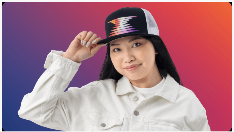
Premium Direct-to-Film printing