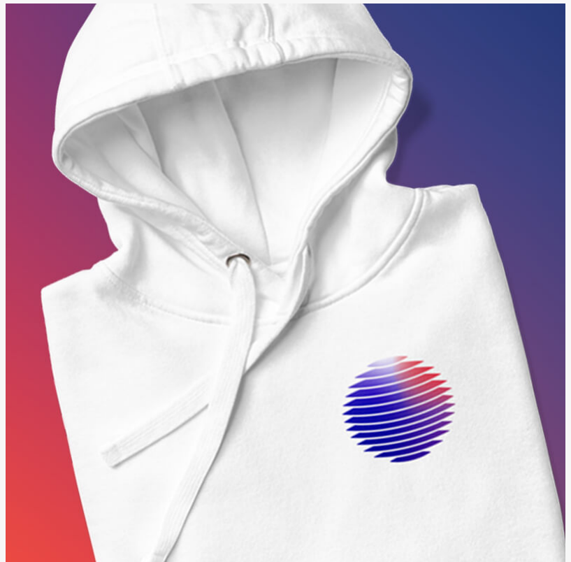
Custom hoodies with DTFlex printing