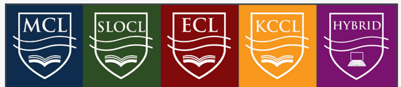
MCL - SLOCL - KCCL - ECL - Hybrid