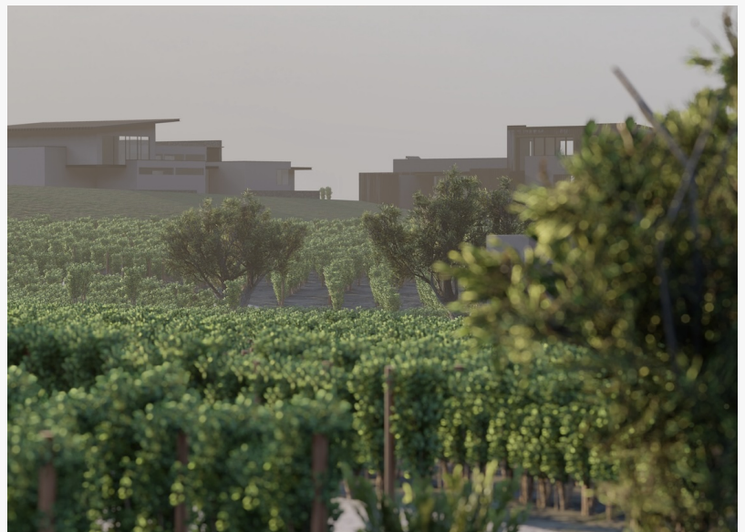
Puerta del Lobo offers a celebration of outstanding wine, with private vineyards for each property and the opportunity for owners to craft their own personal wine with support of a master winemaker.