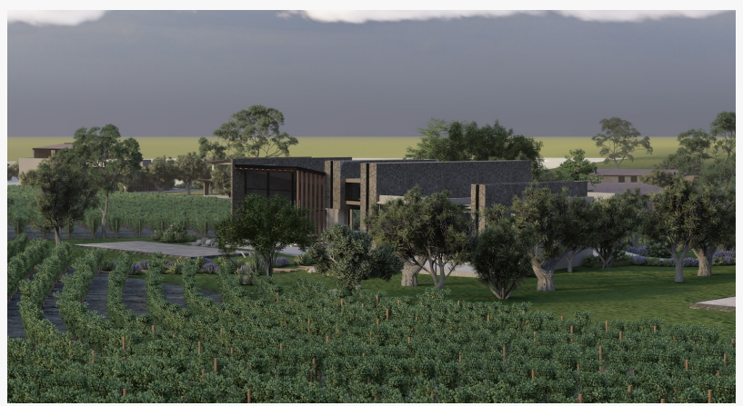
Puerta del Lobo will be a collection of 54 luxury residences designed to integrate seamlessly with the surrounding landscape.

The Texas development is expected to generate hundreds of construction jobs and long-term hospitality, tourism, and vineyard operations roles once open. Puerta del Lobo is also investing in local partnerships with growers, artisans, and businesses to ensure the project supports the broader regional economy. Beyond direct economic benefits, the development is designed to foster cultural exchange, culinary tourism, and sustainable land stewardship. The project is being developed to preserve the beauty and aesthetics of the Texas Hill Country and is also committed to dark sky lighting and sustainable water usage practices to protect the area’s aquifer. The final project will also include Chef-led restaurants, green areas, recreational amenities, a club house, a wedding venue, an exclusive boutique hotel, and attached commercial areas.