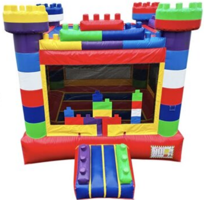
Lego Bounce House - Jojo's Party Rentals