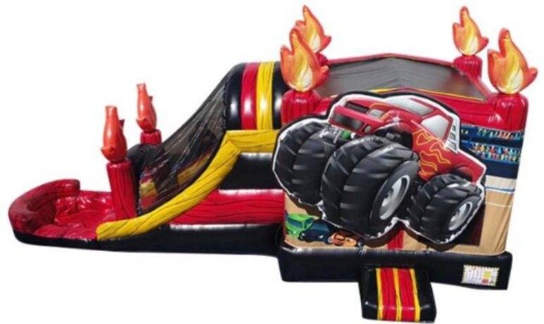
27FT Monster Truck Combo - Jojo's Party Rentals