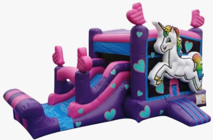
25ft Unicorn Combo - Jojo's Party Rentals

Customer satisfaction has been a key factor in the company's growth, with Jojo's Party Rentals receiving consistently positive reviews for professionalism, quality of equipment, and ease of