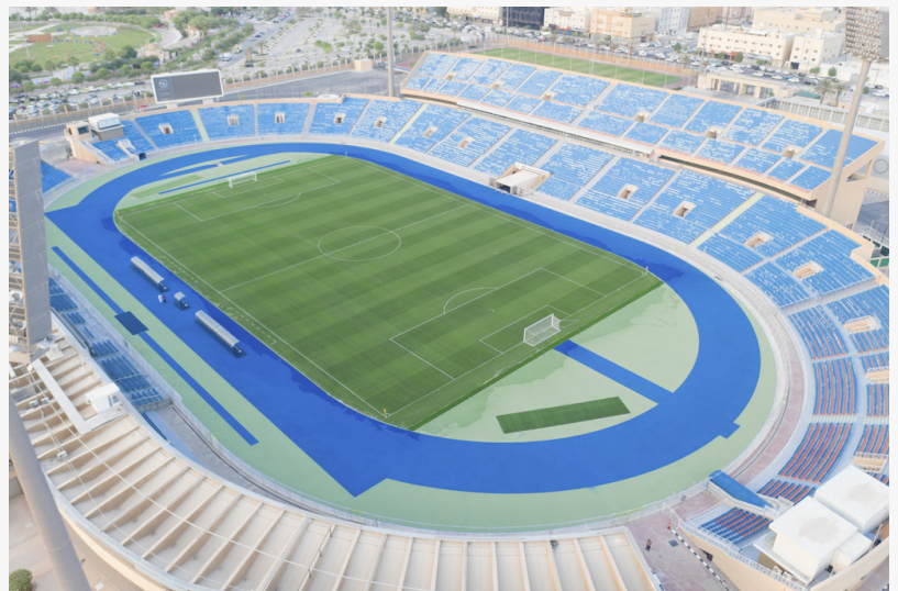
Prince Faisal bin Fahad Sports City