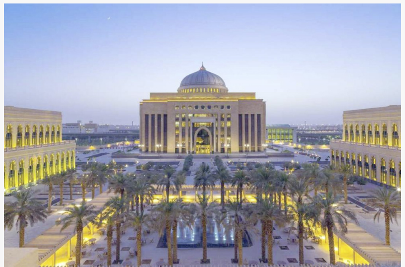
Princess Nourah Bint Abdulrahman University Athletes Village