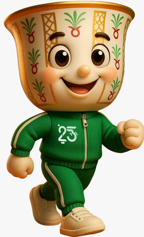
The Islamic Solidarity Games Mascot

Speaking on the occasion, HH Prince Fahad Bin Jalawi Al Saud, Chairman of the Supreme Organising Committee, stated "The slogan 'One Nation' reflects