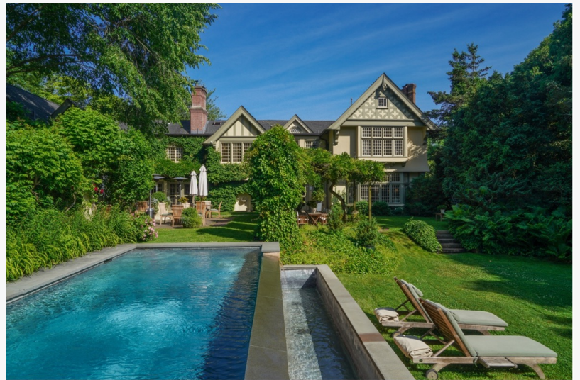
The Baker House 1650