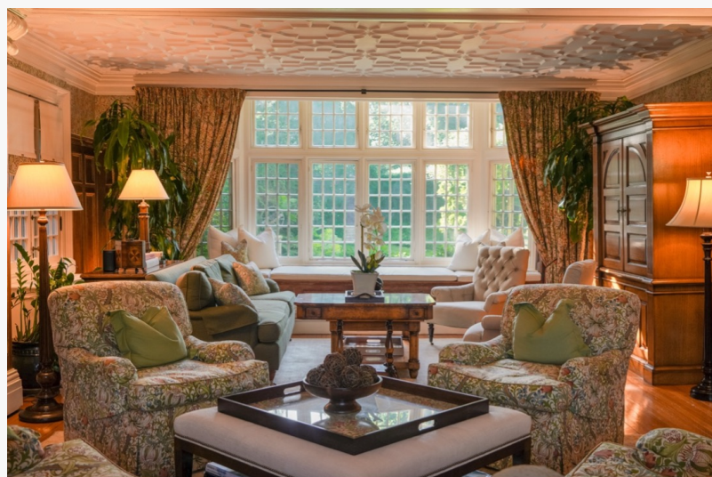
The Baker House 1650

Beyond the marquee events, the village offers its own fall itinerary: long walks along Main Beach in the brisk ocean air, visits to local galleries and antique shops, and seasonal dining that