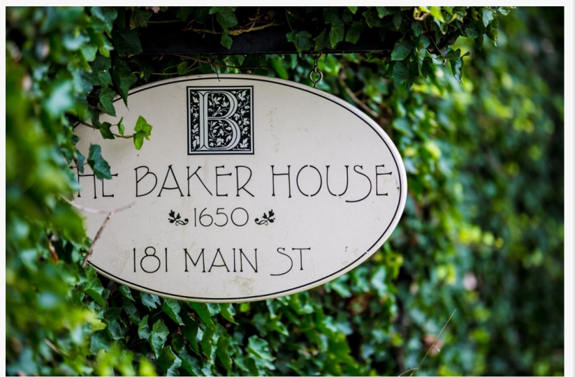
The Baker House 1650

Nestled in the beautiful, historic Village of East Hampton, NY, The Baker House 1650 is a masterpiece of 17th Century Cotswold-inspired architecture. Throughout the property, guests find a sense of historical legacy and majestic aura from the classic inspired English manor. There's a balance of old-world charm with modern conveniences and amenities. For more information, please visit www.bakerhouse1650.com