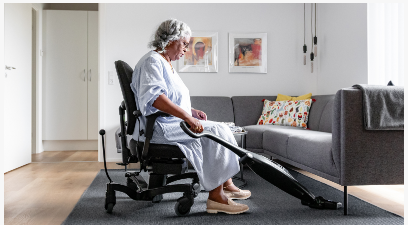
VELA Independence Chair with Power Wheels helps seniors stay active and independent at home