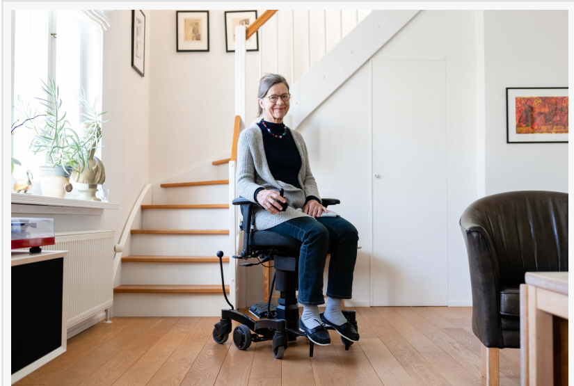
VELA Independence Chair with Power Wheels for seniors and adults with mobility challenges

The VELA Independence Chair with Power Wheels combines the compact design of an office chair with the supportive features of an electric mobility chair, creating a new power-assisted chair option for those seeking a wheelchair alternative. Designed for