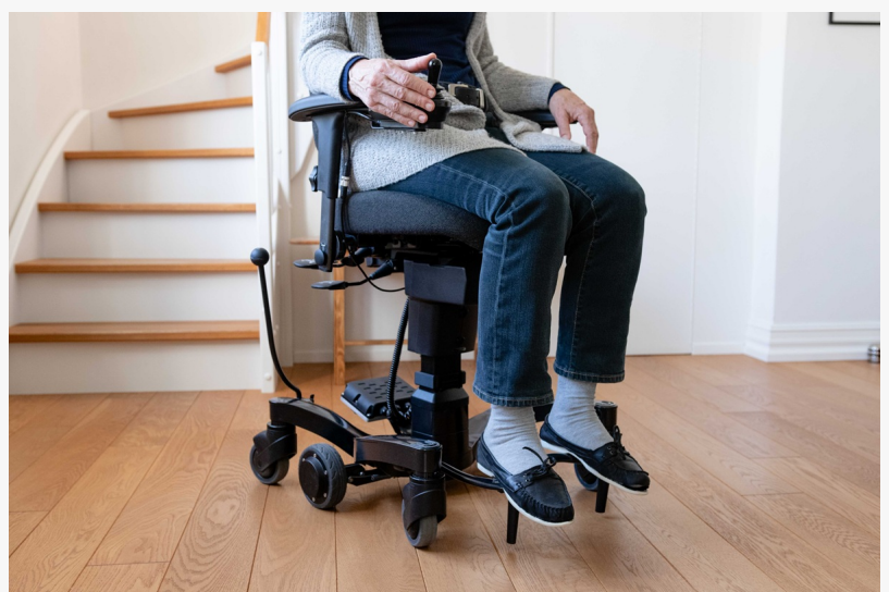
VELA indoor mobility chair with Power Wheels, 360° maneuverability, and electric height adjustment for seniors and adults with disabilities

- A mobility aid that fits your lifestyle The stigma-free, elegant design blends seamlessly into any home, promoting