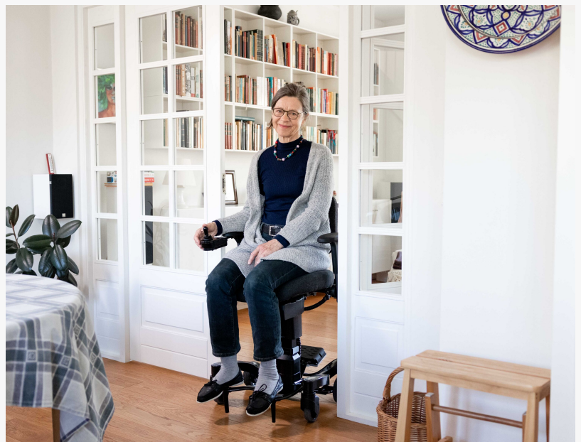
VELA Power Wheels indoor mobility chair for seniors and adults with disabilities seeking independence