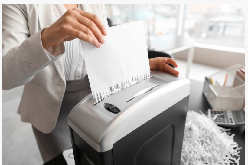
Professional document shredding service in LA

The services are not just for offices and large companies. Individuals with personal records, bills, or files at home also use these services. At-home shredders are not always reliable or fast. Williams provides a stronger, more trusted way to make sure private information does not fall into the wrong hands.