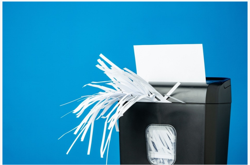
Secure Shredding Services Across Los Angeles