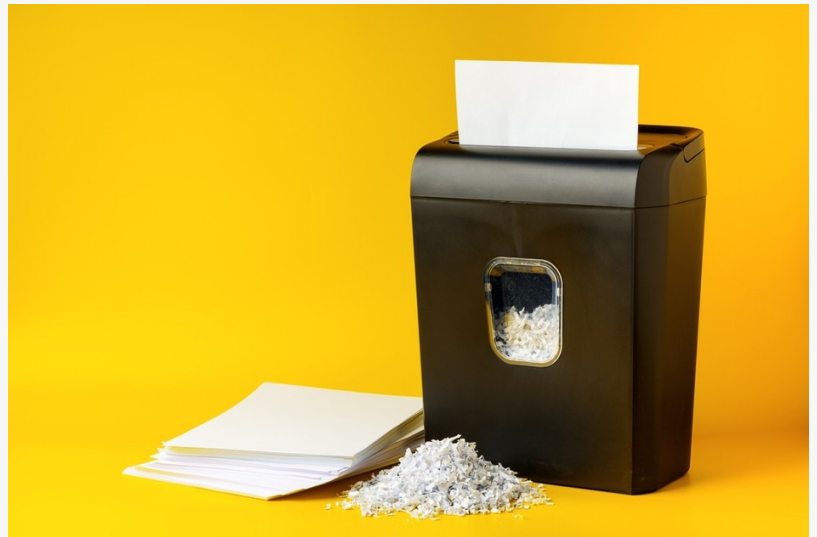
document shredding service in LA