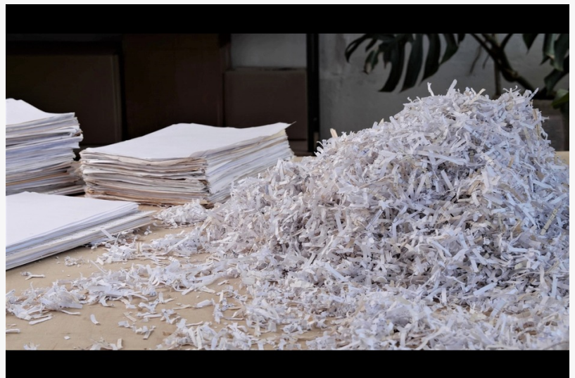
Professional paper shredding company in LA,