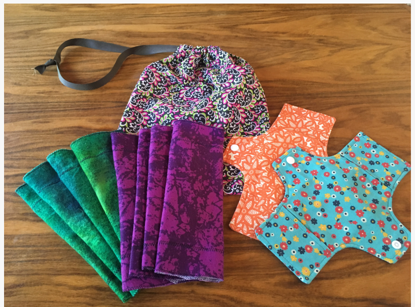
Sample Save a Girl kit