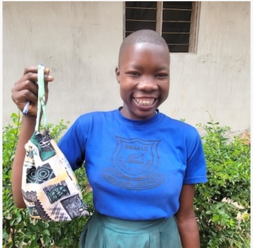
Ugandan Save a Girl kit

TGUP's Save a Girl ™ (SaG) kit is a set of washable, reusable sanitary pads that TGUP makes and donates to adolescent girls in nine developing world countries. The kits cost $7 to make and are given free of charge to recipient girls.