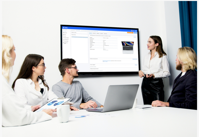
Timly asset management software in every office