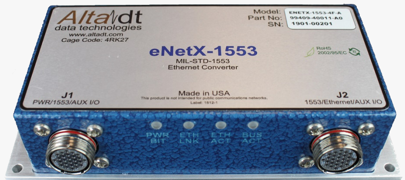
Alta Advanced 1553 Ethernet Converter

This press release can be viewed online at: https://www.einpresswire.com/article/856797082 EIN Presswire's priority is source transparency. We do not allow opaque clients, and our editors try to be careful about weeding out false and misleading content. As a user, if you see something we have missed, please do bring it to our attention. Your help is welcome. EIN Presswire, Everyone's Internet News Presswire™, tries to define some of the boundaries that are reasonable in today's world. Please see our Editorial Guidelines for more information. © 1995-2025 Newsmatics Inc. All Right Reserved.