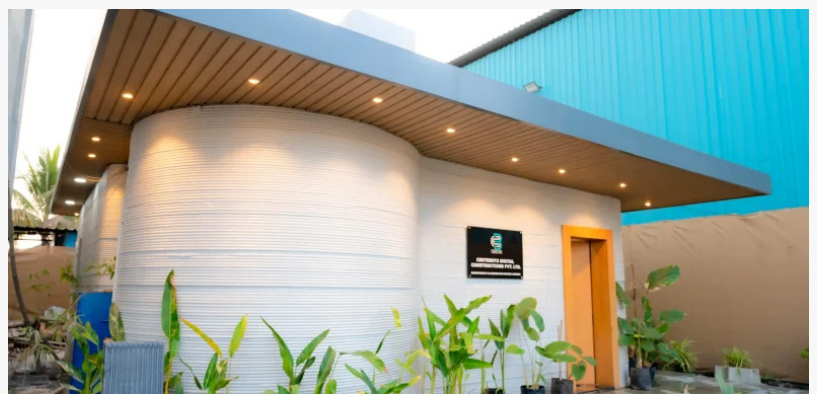
Cretebots 3D Concrete Printing office