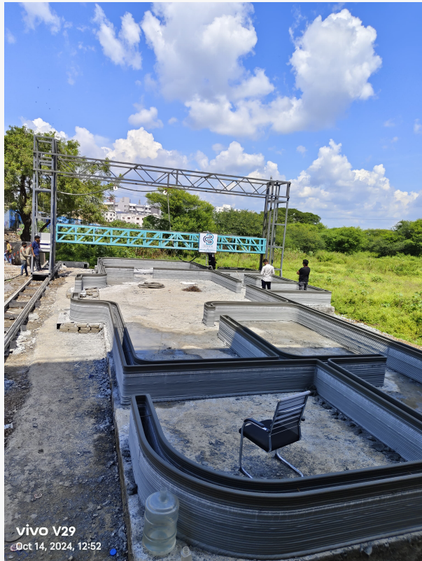
Cretebots 3D Concrete Printing | Fastest Large-Scale Project in India #3DConstruction #ConcretePrinting

This press release can be viewed online at: https://www.einpresswire.com/article/857050306