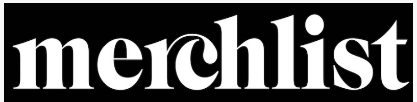
Merchlist Logo Custom Gifts &amp; Giveaways