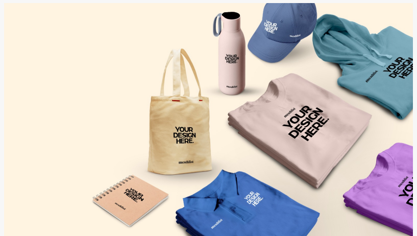
Merchlist Custom Gifts & Giveaways