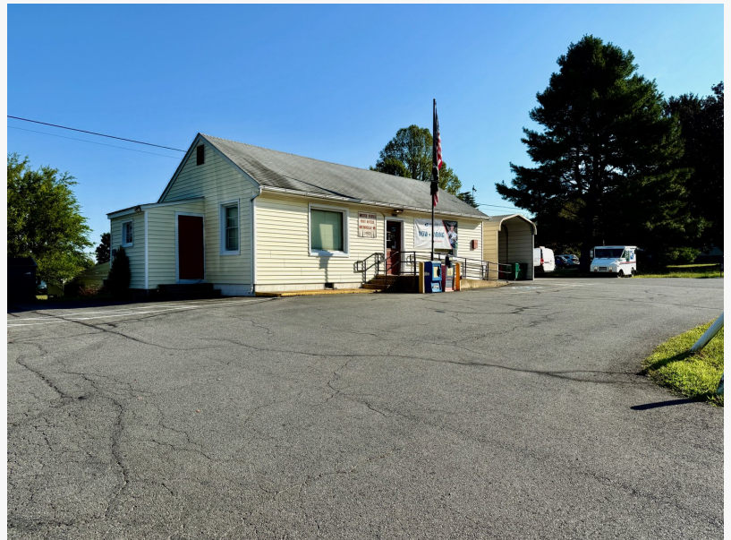
23209 Village Rd., Unionville, VA 22567