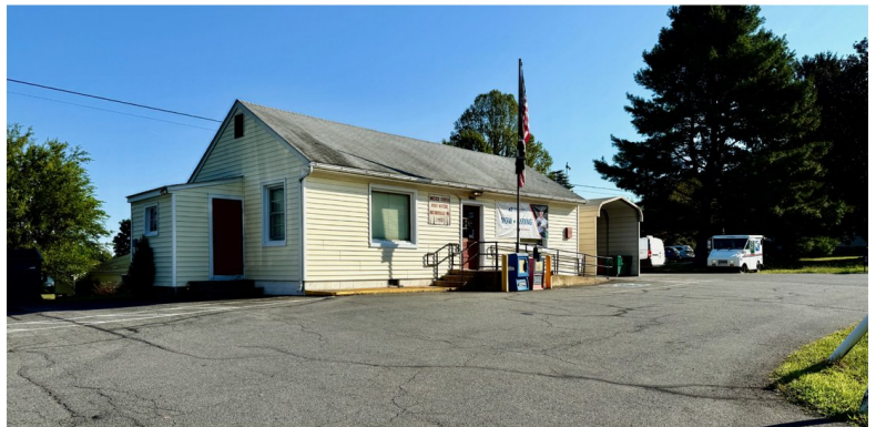
23209 & 23217 Village Rd., Unionville, VA 22567 (Orange County)