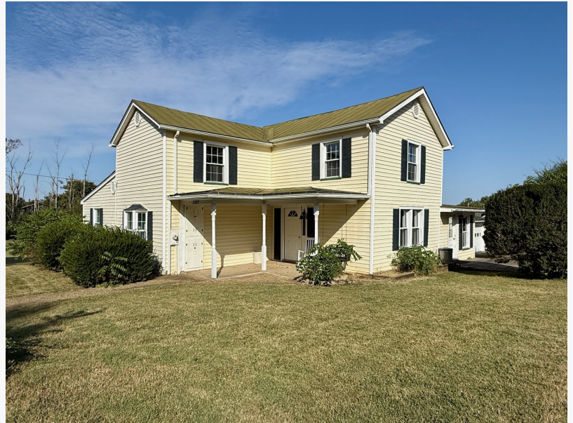
23217 Village Rd., Unionville, VA 22567