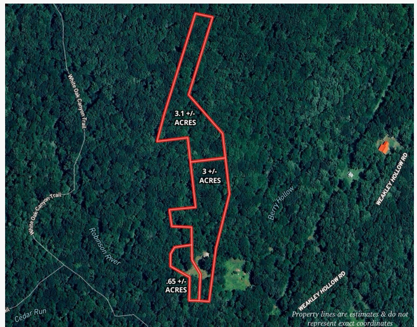
201 Chad Berry Ln., Syria, VA 22743 (Madison County)

Nicholls Auction Marketing Group, Inc., is a professional accelerated marketing firm specializing in the promotion and sale of real estate via the auction method of marketing. Headquartered in Fredericksburg, VA, NAMG has been serving the needs of the Mid-Atlantic region since 1968. The Nicholls team comprises world and state champion auctioneers, an award winning marketing staff, and sales percentages unmatched in the industry. For more information about Nicholls Auction Marketing Group, Inc., visit www.nichollsauktion.com or call 540-898-0971.