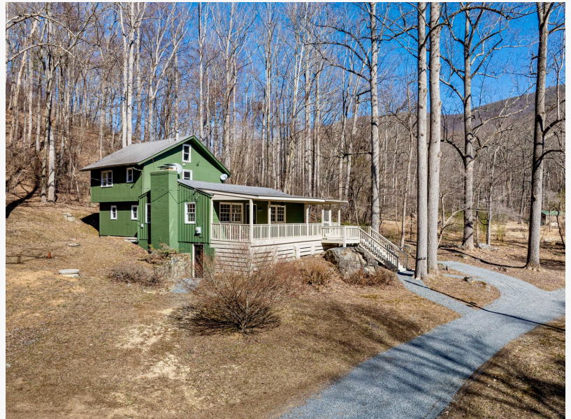
201 Chad Berry Ln., Syria, VA 22743 (Madison County)