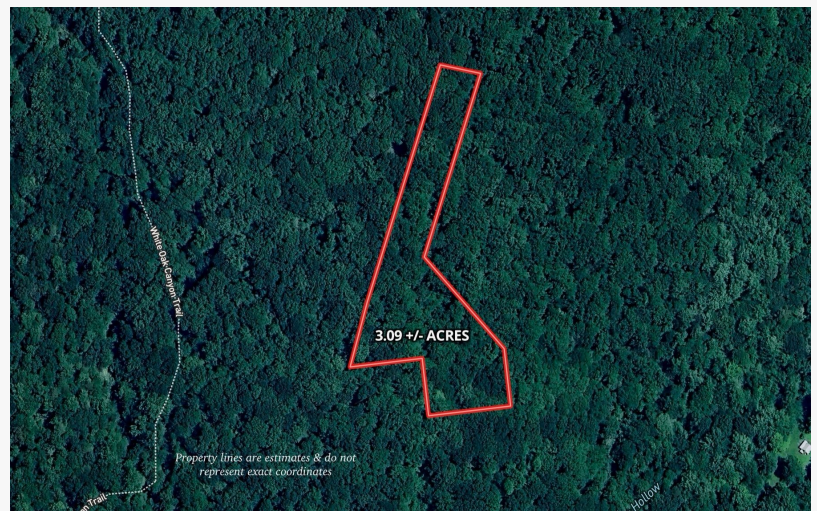
201 Chad Berry Ln., Syria, VA 22743 (Madison County)