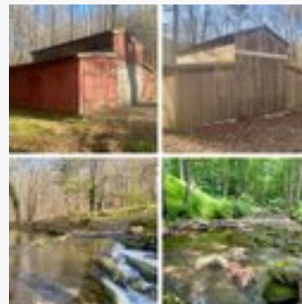
201 Chad Berry Ln., Syria, VA 22743 (Madison County)