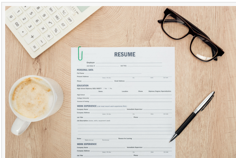
Dentist Jobs Ireland - CV Assistance with dentistryjobs.ie