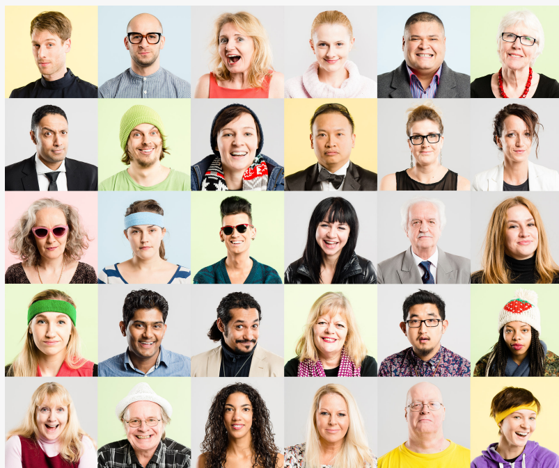
Dental Jobs in Ireland - Dental Job Demand Rises as Ireland Expands Workforce Capacity