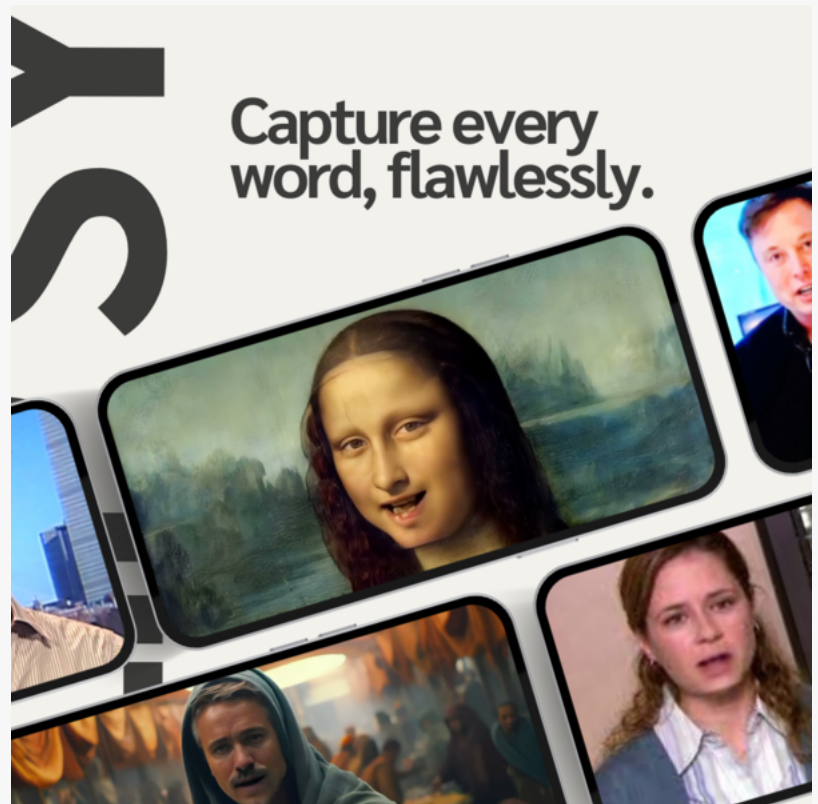
Lip Sync Templates