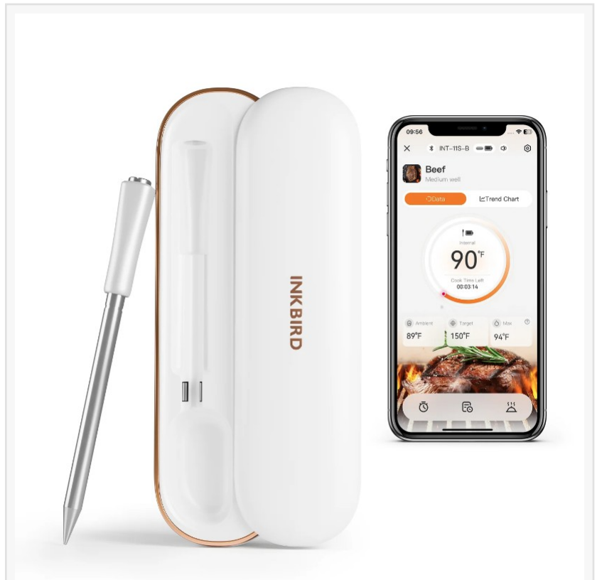
INKBIRD Bluetooth Meat Thermometer INT-11S-B