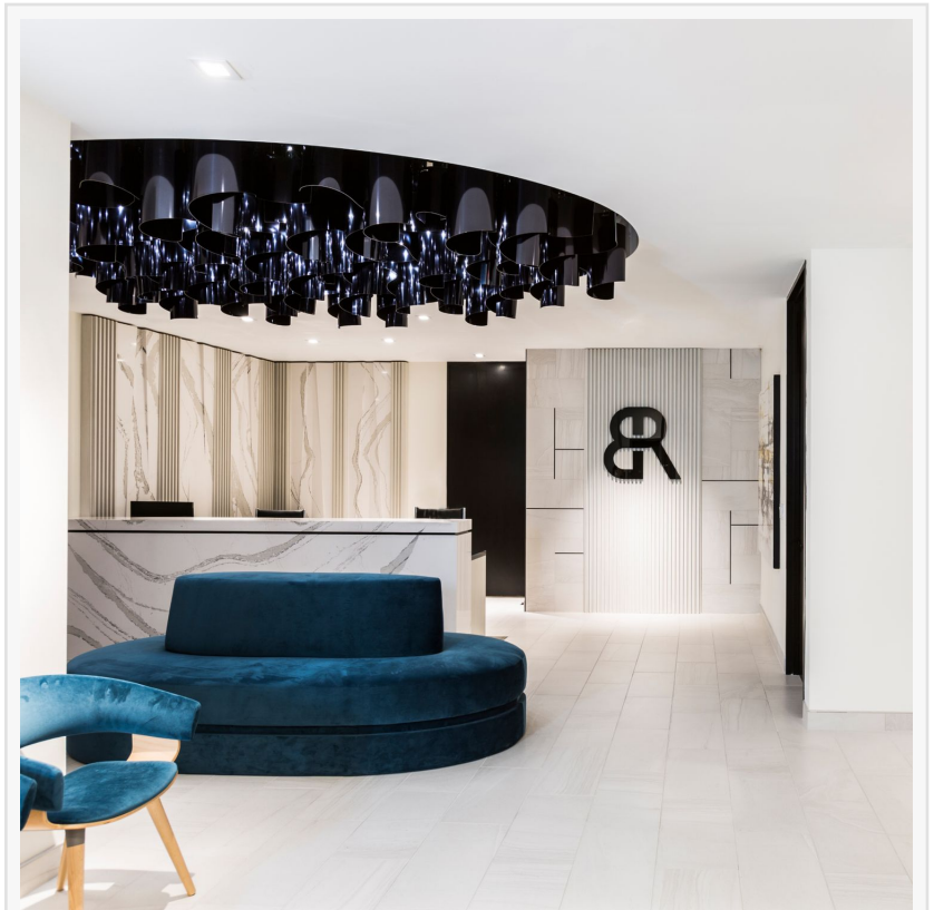
RISE Med Spa Reception