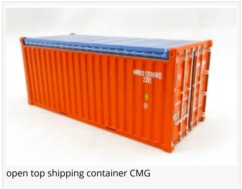
open top shipping container CMG

“Our Open Top Containers are engineered for industries that move heavy and complex cargo daily,” said Ken Malkoç, CEO of CMG Containers. “They simplify top-loading logistics without compromising strength, security, or weather protection.”