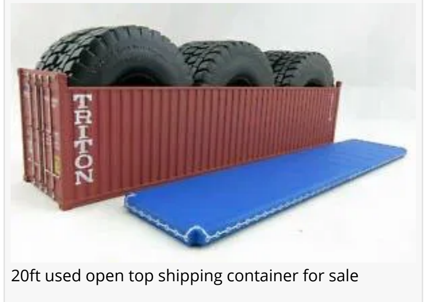
20ft used open top shipping container for sale