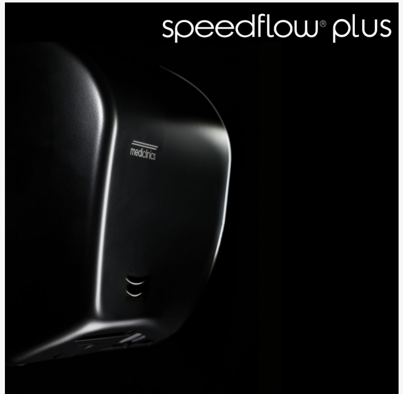
Speedflow Plus by Saniflow: Quiet, Durable, and Efficient Hand Dryer for Busy Environments