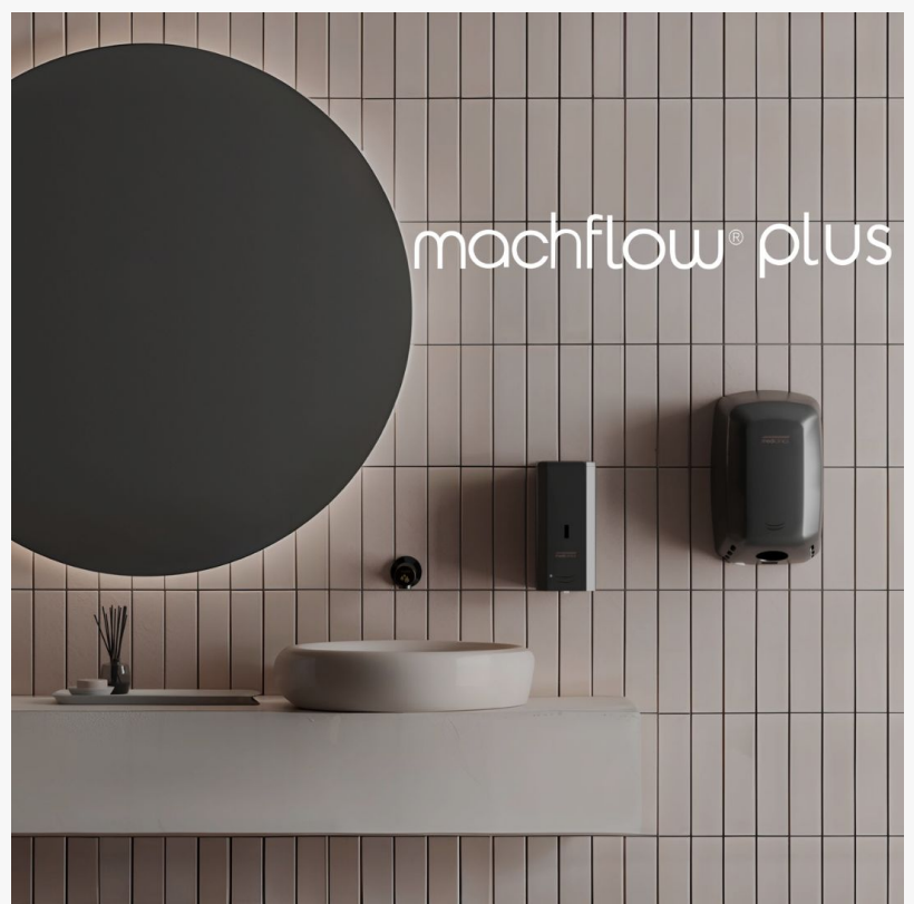
Machflow Plus Hand Dryer by Saniflow Corp.