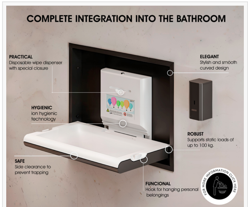
Babymedi Horizontal Changing Station