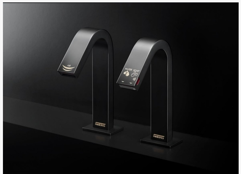
The All-In-One Complete Faucet System from Saniflow