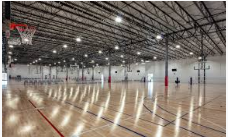
Inside View of AmeriSports 66,000 Sq. Ft Indoor Facility Located in Rockwall, TX