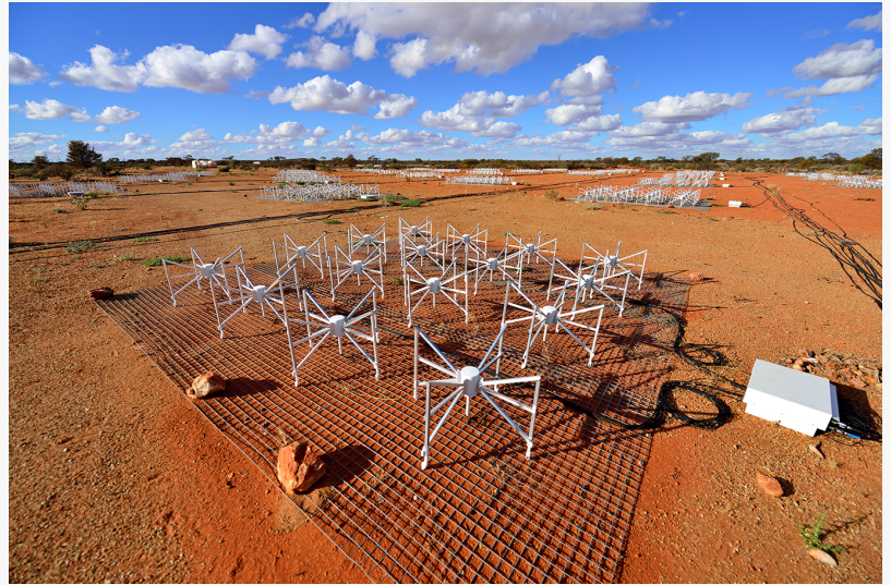
Caption: Antennas from the MWA telescope, on Wajarri Country in Western Australia

The new image, which focuses on our own Galaxy, offers twice the resolution, ten times the sensitivity, and covers twice the area compared to the previous GLEAM image released in 2019. This significant improvement in resolution, sensitivity and sky coverage allows for a more detailed and comprehensive study of the Milky Way, providing astronomers with a wealth of new data and insights.