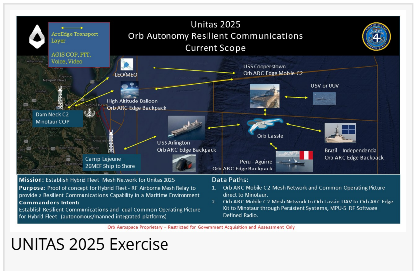
UNITAS 2025 Exercise

submarines, and aircraft, conducting exercise operations along the U.S. East Coast and near Naval Station Mayport, FL, Marine Corps Base Camp Lejeune, NC, and Naval Station Norfolk, VA, last September/October. Among the ships were the USS Cooperstown, USS Arlington, USS Chesty Puller, the Peruvian Aguirre, and the Brazilian Independencia.