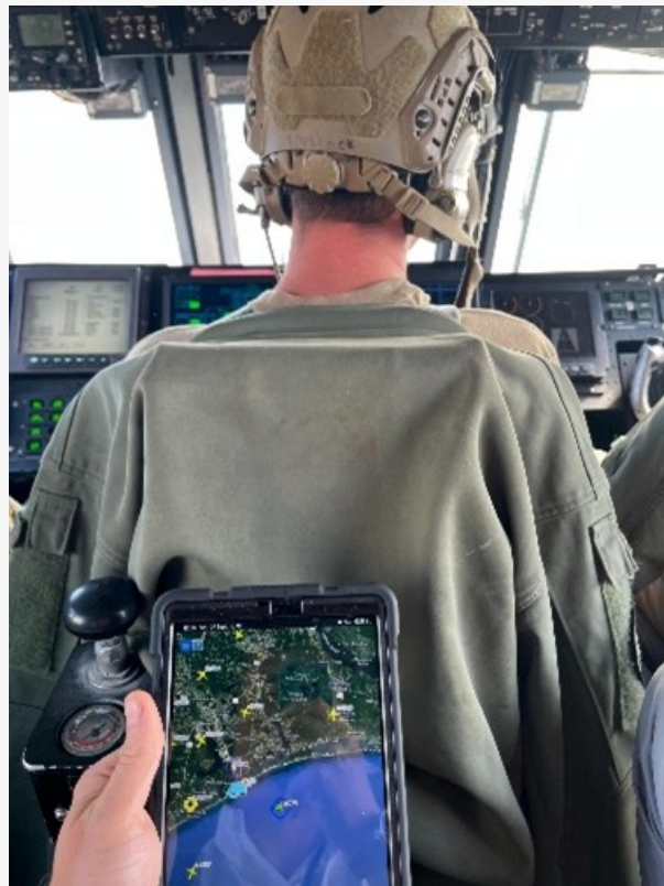
AGIS Live At Sea - UNITAS