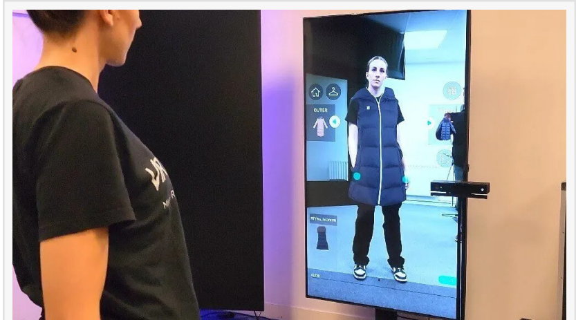
Virtual On's new Fashion Mirror operates entirely remotely touchless, seamless, and ready to use.

Virtual On Ltd., a UK-based leader in holographic and interactive display technologies, has unveiled a new business model for its Fashion Mirror – Virtual Fitting Room, making it more accessible, affordable, and effortless than ever.