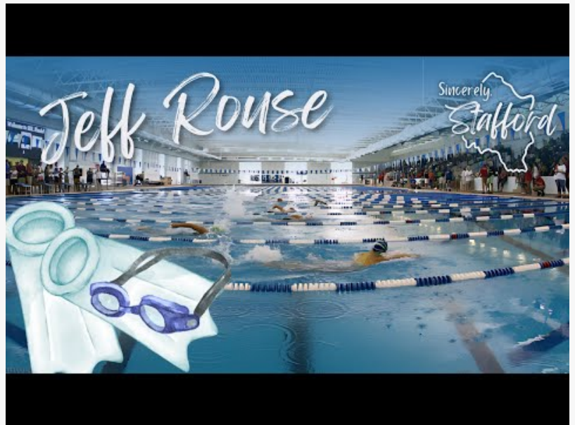
Welcome to the JRSSC

/EINPresswire.com/ -- Nearly a decade after opening its doors, the Jeff Rouse Swim & Sport Center continues to anchor Stafford County's commitment to health, community, and economic growth. Owned by Stafford County and operated by Eastern Sports Management (ESM), the 76,000-square-foot complex has evolved into one of Virginia's most impactful recreation and tourism assets—driving more than $12 million in annual economic impact and welcoming over 350,000 visitors each year.