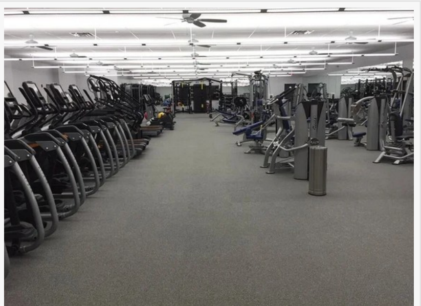
JRSSC Fitness Center-Community Memberships

A 5,000-square-foot fitness center, group exercise studios, locker rooms, café, and full-size basketball court