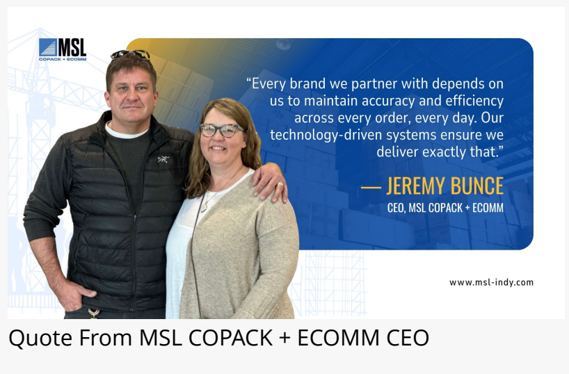
Quote From MSL COPACK + ECOMM CEO