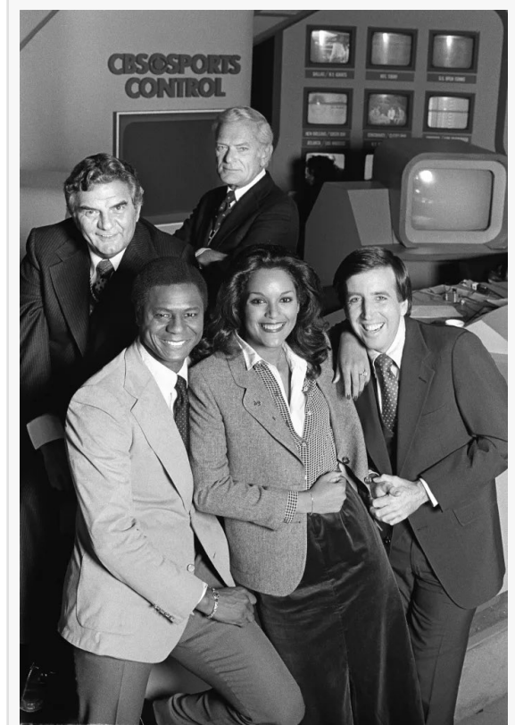
CBS NFL Today in the 70s: Bottom row (l-r) Irv Cross, Jayne Kennedy and Brent Musburger. Top: (l-r) Jimmy the Greek and Jack Whitaker.

BLVKBOOK Gallery is a premier art destination showcasing visionary Black and multicultural artists. Located on Level 8 of the Beverly Center, it provides a creative space that bridges art, identity, and community, offering cultural experiences that elevate diverse narratives.