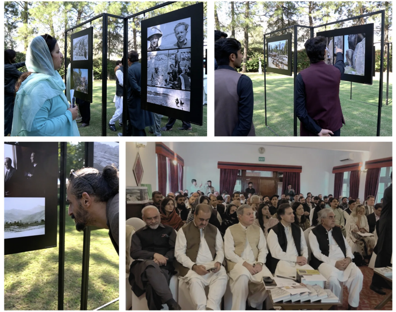
Highlights from the 70th Anniversary Celebration of the Italian Archaeological Mission in Pakistan, co-sponsored by WAKSAW Archaeological Alliance.